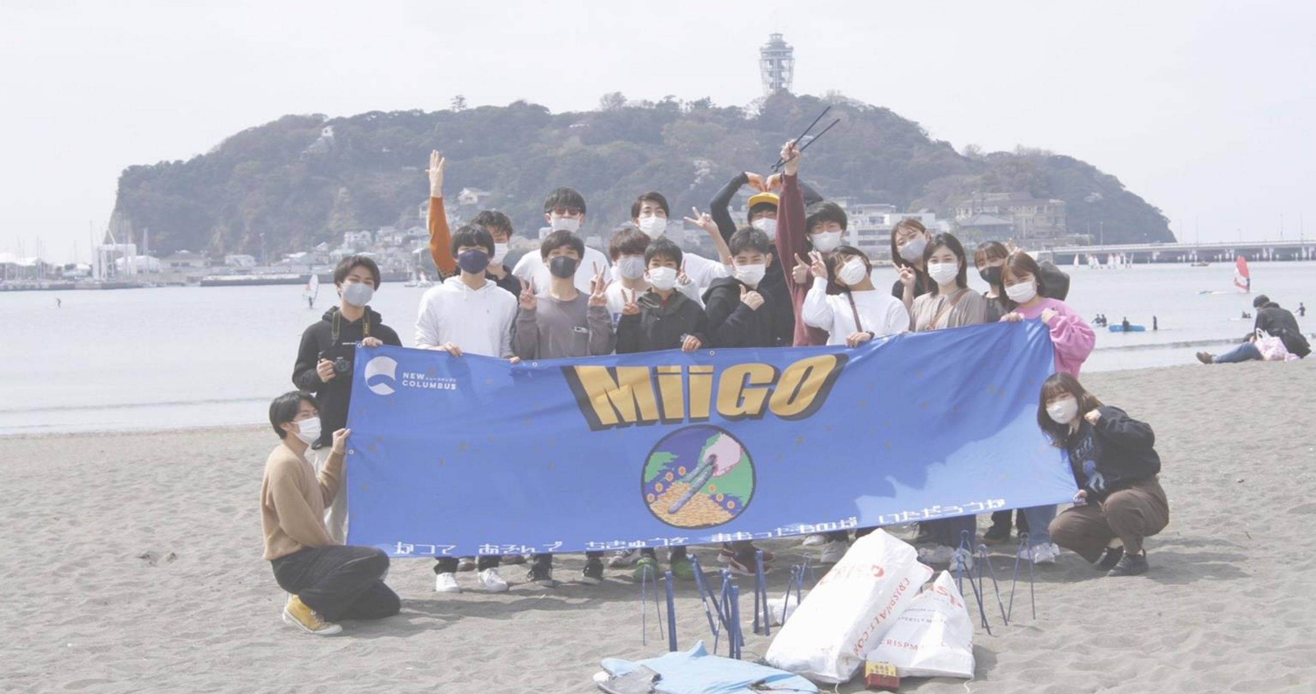
Members of Student Organization NEWCOLUMBUS